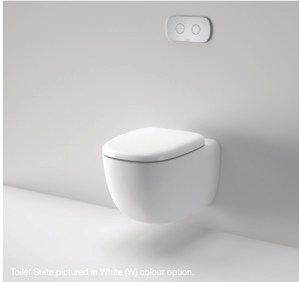
Toilet Suite pictured in White (W) colour option.

Embrace natural luxury with the Caroma Contura Collection - sculptural design with an organic simplicity to create a sense of subtle indulgence for your bathroom. The suite comprises of the Contura II Cleanflush™ pan and trusted Caroma Invisi II cistern to offer a seamless finish to any domestic or commercial bathroom.